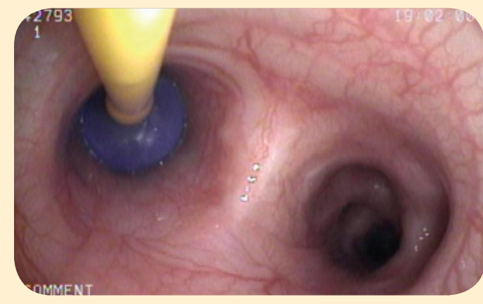
Bronchoscopic image showing placement of an endobronchial blocker for one-lung ventilation prior to thoracoscopic surgery.