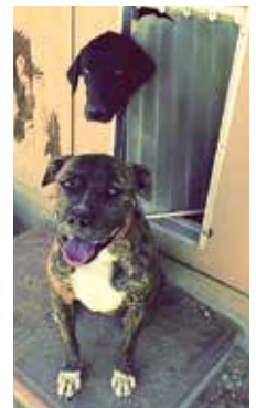
Teddy and Ramona at Best Friends